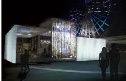
ARTBAY HOUSE will be splendidly illuminated.