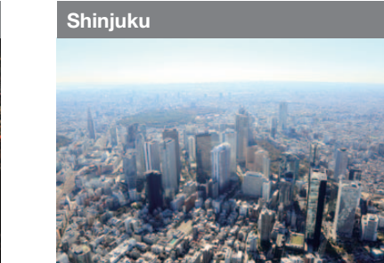
After a half-century of development on the site of the former Yodobashi water purification plant, the business district is entering a period of renewal.

Japan's first business district. Recent years have seen a transformation of this area into a lively, bustling space.