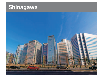
Located near Haneda Airport, developments are underway to turn this area into a center of international exchange.